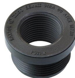
Type BJ Round