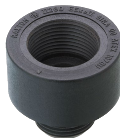
Type AJ Round

Nylon adaptors and reducers are Exe only and designed with a circular head. Parallel threaded Exe adaptors and reducers are supplied with an undercut and EPDM O-ring to maintain the IP integrity of the installation. Raxton adaptors and reducers are marked with the applicable approval number and size.